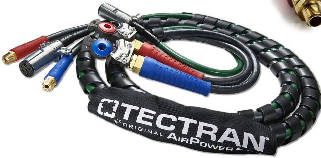
TECTRAN ORIGINAL AIRPOWER