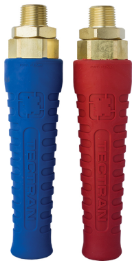
FLEX HD GRIP