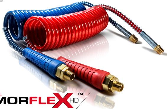
ARMORCOIL ARMORFLEX HD