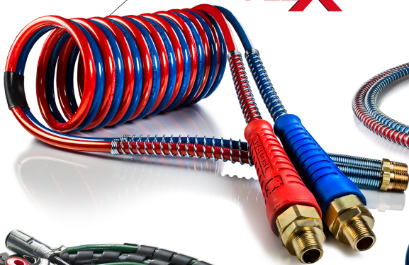
ARMORCOIL MAGNUM FLEX HD