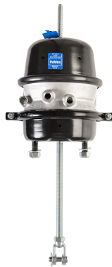
Brake Chambers - Haldex