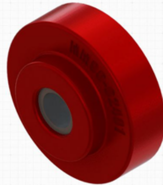
MM96-62401-HT (CAD Rendering) Engine Mount (High Temp)

ATRO High-Temp parts have unmatched heat resistance with our custom poly formula that won't degrade when exposed to chemicals, weather, or the hostile engine environment that breaks down rubber parts.