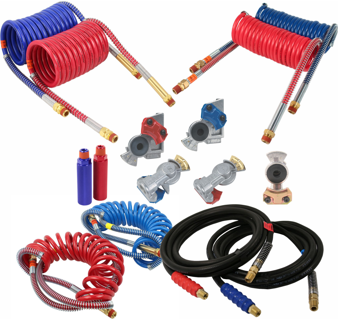
Phillips Coiled Air Products