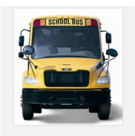
Foreground - Hawkeye® front cross view mirror assembly. Background - DuoStyle® assembly w/black arms