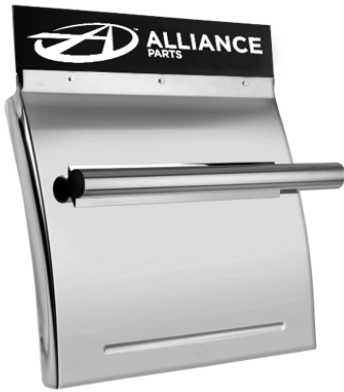
Fenders - Alliance

Suggest the following to your customers for additional sales: