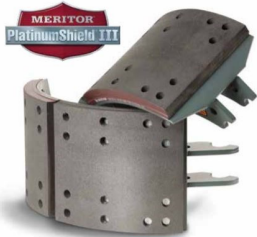
100 Million Brake Shoes....and counting

MeritorPartsXpress.com/Brake Shoes & Lining ( https://www.meritorpartsxpress.com/webapp/wcs/stores/servlet/CategoryDisplay?urlRequestType=Base&catalogId=10051&categoryId=64692&pageView=list&urlLangId=-1&beginIndex=0&langId=-1&top_category=63501&parent_category_rn=63501&storeId=10154 )