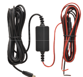
Direct Wire: CA-MICROUSB-003