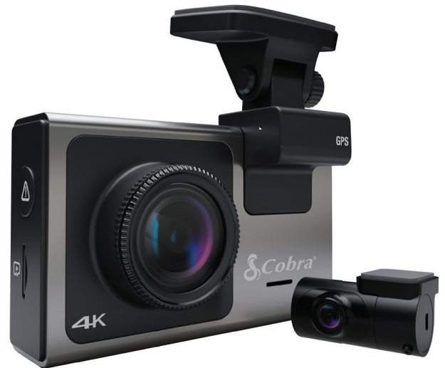
Rear-View Camera Included

The SC 400D is the ultimate smart dash cam you need to help you drive smarter and safer. With real-time alerts from the Drive Smarter® community, Ultra HD 4K resolution, and Alexa built-in, the SC 400D combines the best tech in an easy-to-use dash cam.