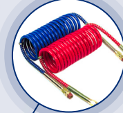
81-0015 15' COILED AIR SET