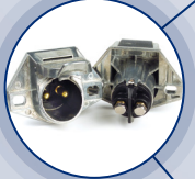
82-1041 2-WAY SOCKET