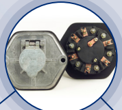
82-0853 CIRCUIT BREAKERS, 7-POLE