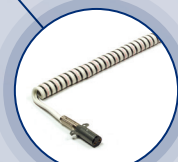
81-2215 15' DUAL POLE