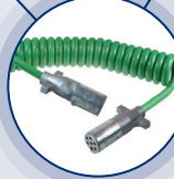
87101 15' ULTRALINK™ POWER CORD