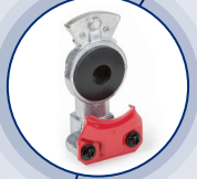
81-0001-R EMERGENCY GLADHAND