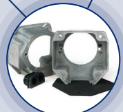
82-0859 NOSE BOX