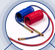
81-0015-40C 15'/40 AIR COIL