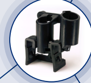
81-0142 POWER CORD & GLADHAND SUPPORT HOLDERS