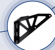
81-2302VM EZ CLAW® PLATE BRACKET, VERSA MOUNT