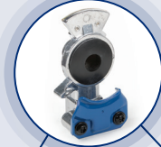
81-0001-B SERVICE GLADHAND

GROTE HAS ALL THE PRODUCTS YOU NEED TO KEEP YOUR EQUIPMENT CONNECTED, PROTECTED, SAFE AND ON THE ROAD.