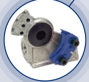
81-0001-38B 38° SERVICE GLADHAND