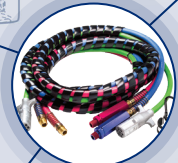
81-3215 3-IN-1 ABS ELECTRICAL & AIR ASSEMBLIES