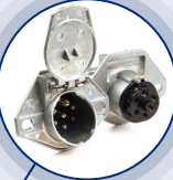
82-1002 HEAVY DUTY 7 POLE SOCKETS