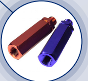
81-0125 ANODIZED GLADHANDLES