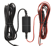
Direct Wire: CA-MICROUSB-003